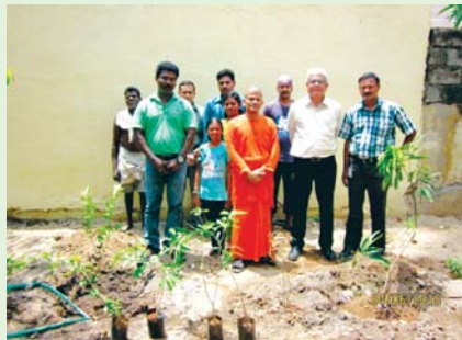
Tree plantation at the Ramakrishna Ashram, Chennai (South Region)