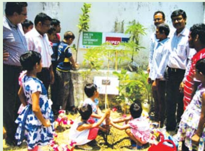
Tree Plantation in APANGHAR, a differently - able school in Kolkata (East Region)