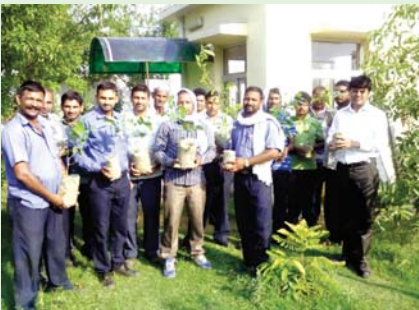
Tree Plantation at Rohtak Filling Plant (North Region)

SUPER Gas celebrated World Environment Day on June 5 to bring in significant change towards environment awareness within the Company, to its stake holders and to the community as a whole for a noble cause of saving our beautiful planet.