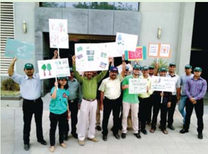
World Environment Day Celebration at our Ahmedabad Office (West Region)