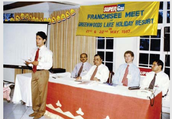
Progress through Partnership Franchisee Meet of West Region Ahmedabad - May, 1997